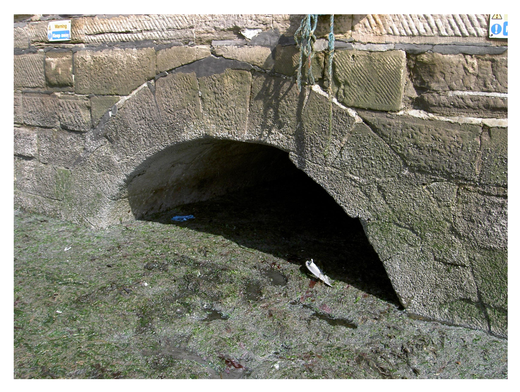
Margate Harbour Sluice -open end of culvert viewed from inner face of Stone Pier