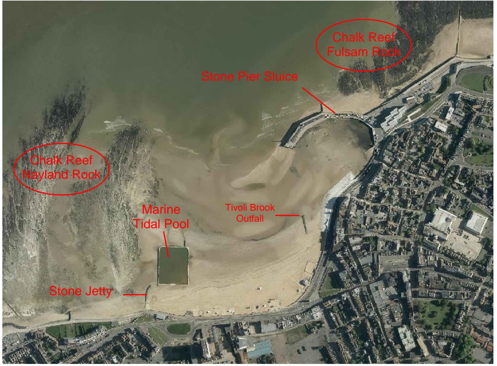
Margate – showing accretion of sediment within the Bay