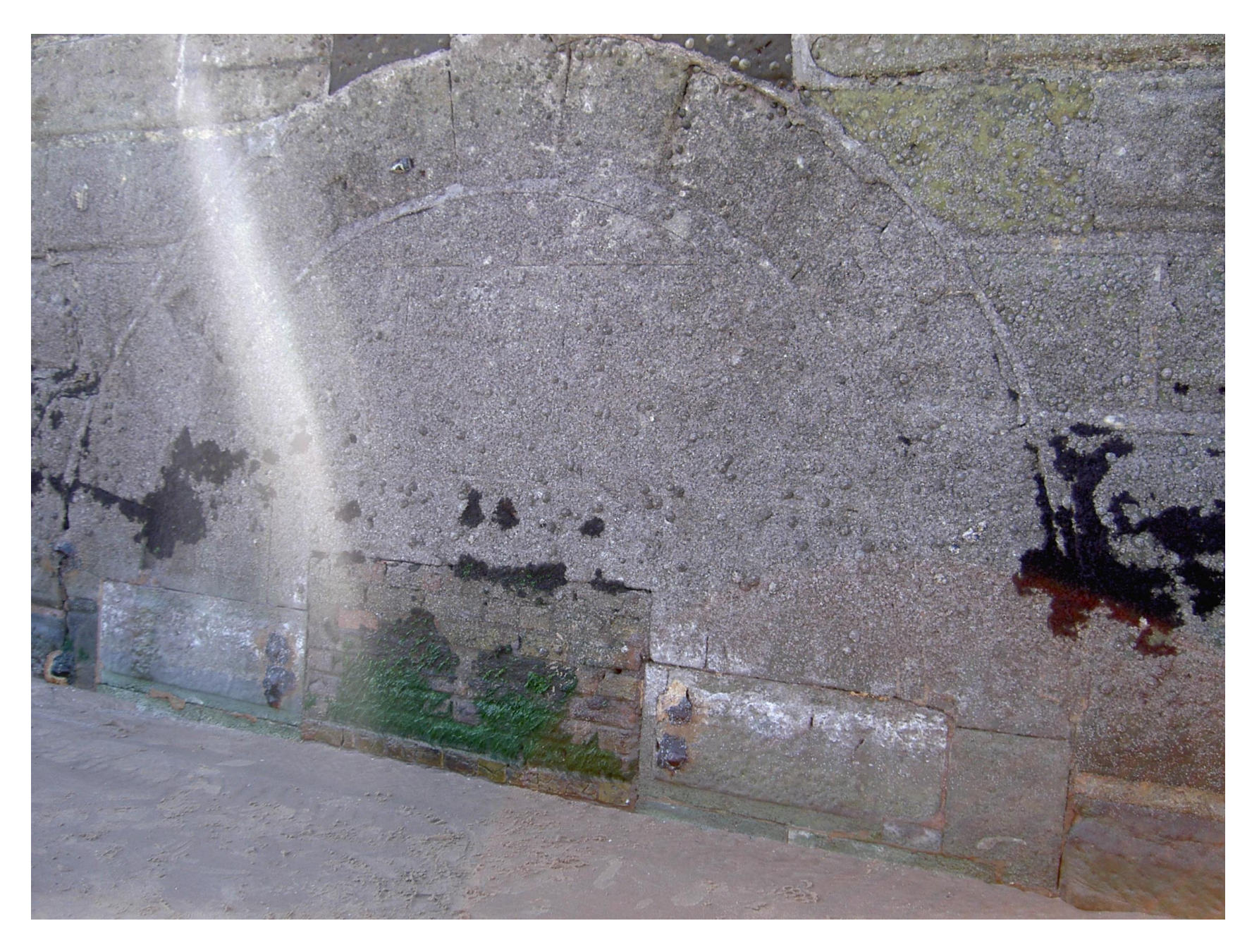
Margate Harbour Sluice -Portland Stone and Brick sealing wall to culvert viewed from outer face of Stone Pier